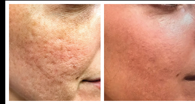
HALO® | 3 MONTHS POST 2 TREATMENTS