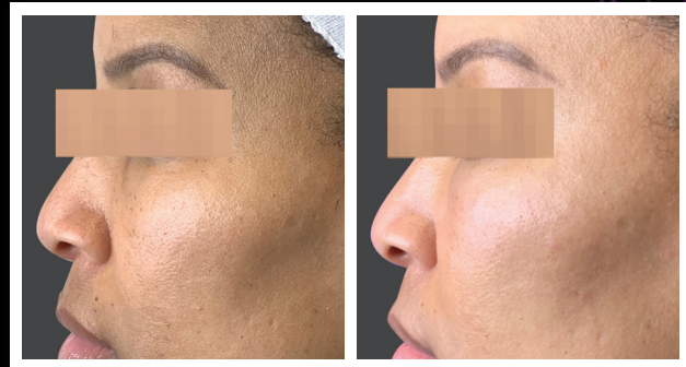
HALO® | 2 WEEKS POST 1 TREATMENT

HALO® restores the glow that sun, time and stress have depleted from your skin.