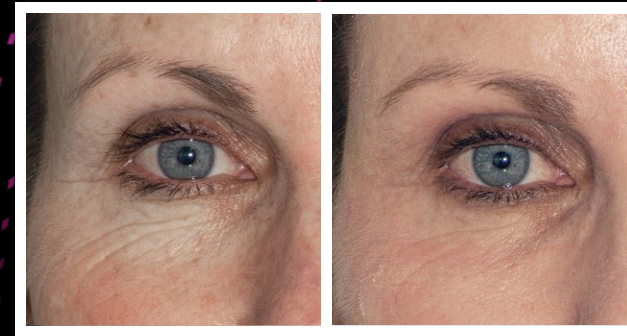
HALO® | 1 MONTH POST 1 TREATMENT