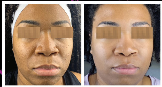
HALO® | 4 WEEKS POST 1 TREATMENT